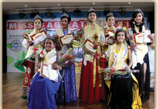
A scene of Mr and Miss Bagmati, a yearly mega event of the School