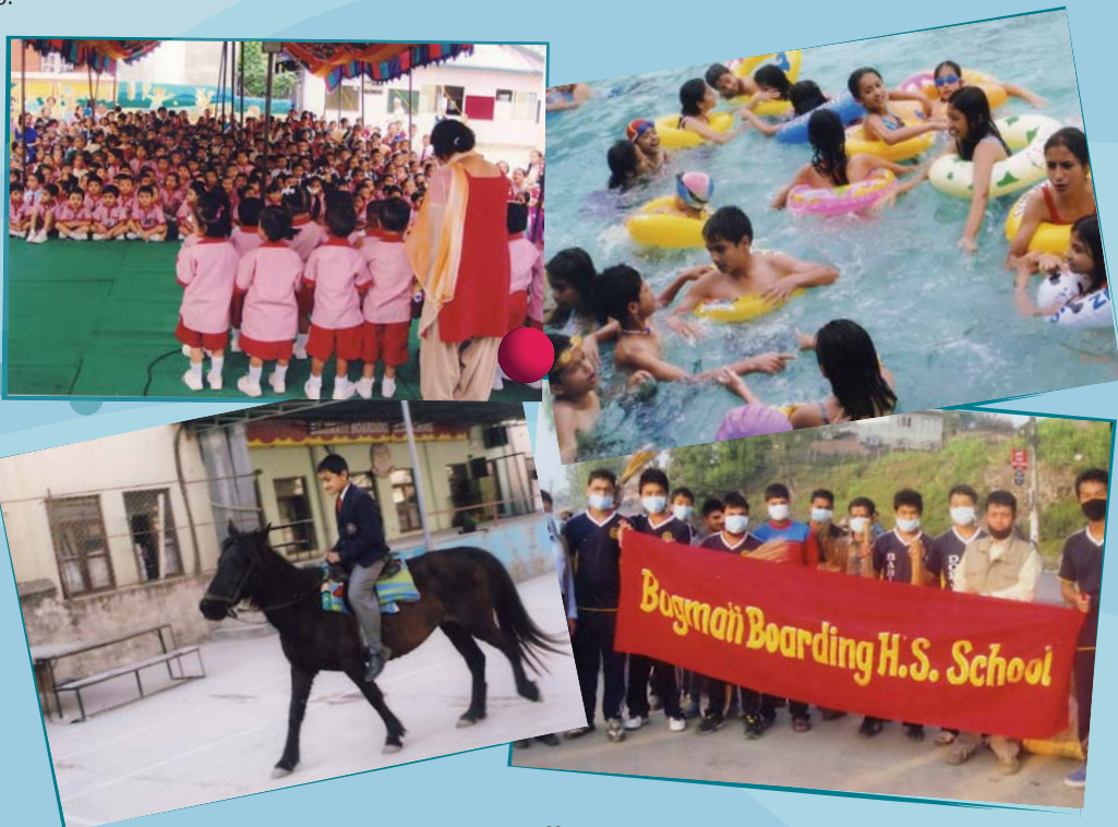
Students participating in different extra-curricular activities