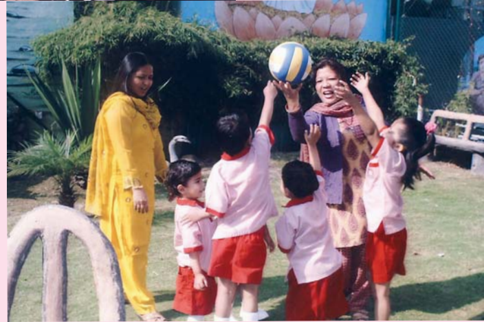
It's fun to play with the lovely kids

School has started play group since the academic session 2020 for limited number of children under the supervision of montessori trained teachers and Aayas.