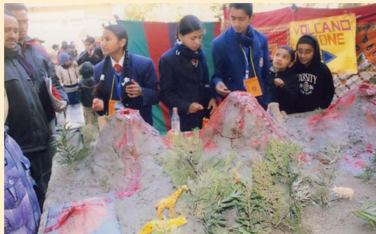
Students demonstrating volcanic eruption during science exhibition

The school is located at Sokedhara, New Colony, one of the most popular VIP residential areas. yet it is not purely even primarily an urban school. It is insulated from the hustle and bustle of city life by spacious grounds, greenery and fields around it. As main route centre, the BBS is accessible by bus, car and other means of public transport from all parts of the Kathmandu valley.