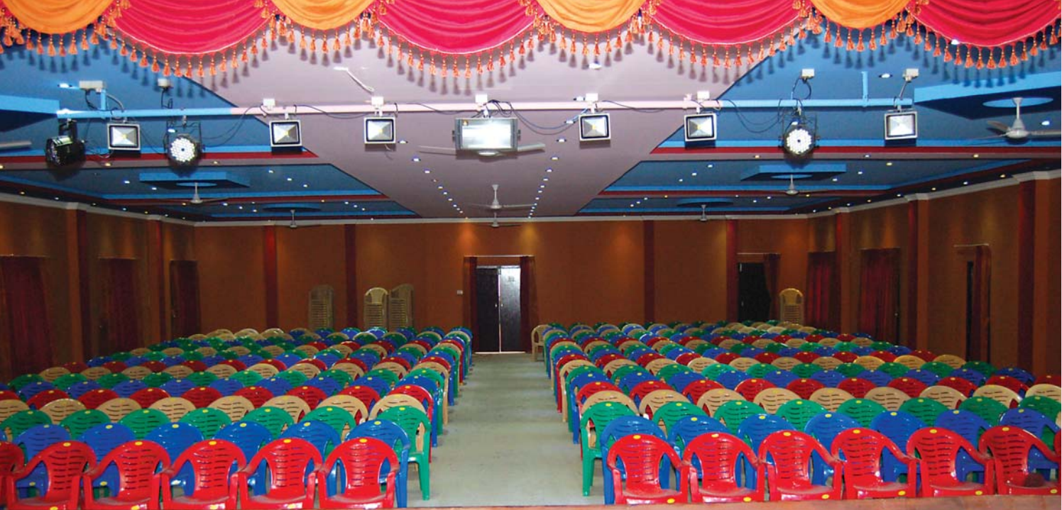
Ultra modern mega hall of the School