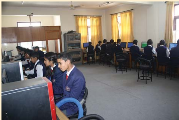
Students' involvement in a computer lab as a part of their curricular

The school has its own sprawling complex amidst 20 Ropanis of land.