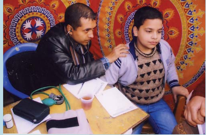
A scene of Health-Camp on the school premises