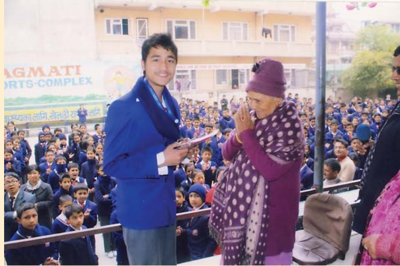
Respected mother of our founder awarding 'Best Rhythm Guitarist' at a function