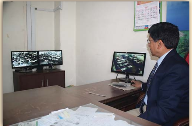
Class activities being monitored with help of CC cameras

School has a big and spacious ultra modern auditorium (capecity 1000) with full size stage for dramas, concerts and plays etc.