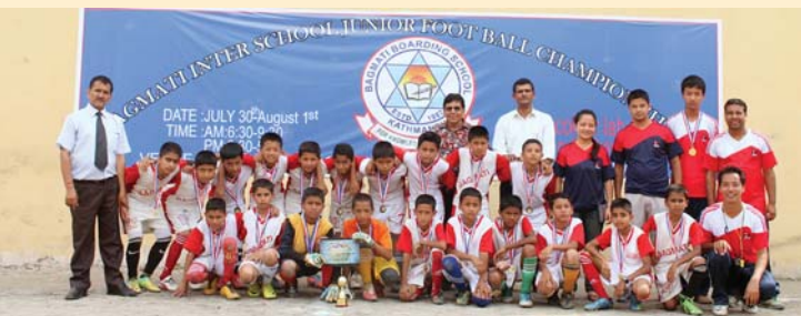
Junior football tournament winners 2014